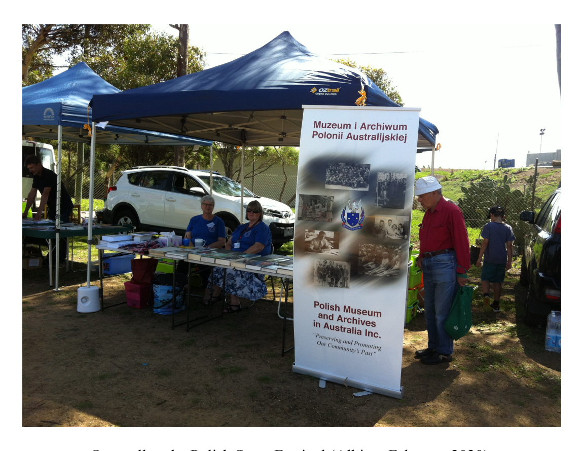
Our stall at the Polish Sport Festival (Albion, February 2020).