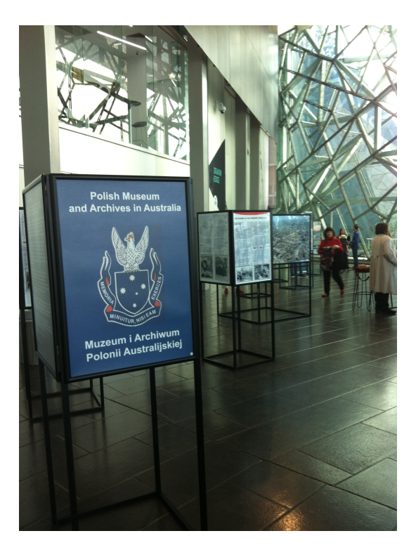
An exhibition "1939- Tragedies of Poland – 1944" (Polish Festival at Federation Square, Deakin Edge, Melbourne, Nov 2019).