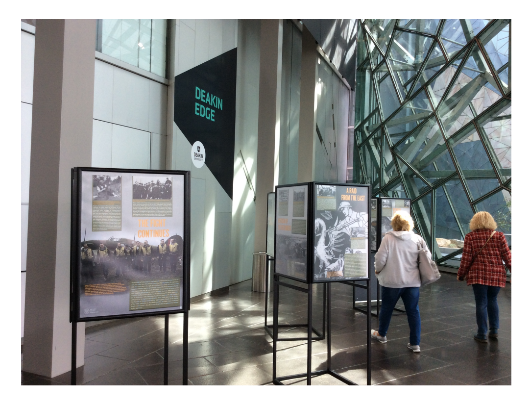
The exhibition "1939- Tragedies of Poland – 1944" (Polish Festival at Federation Square, Deakin Edge, Melbourne, Nov 2019).