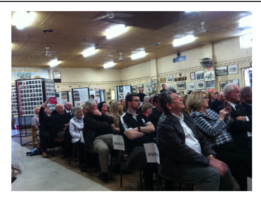
Opening of the exhibition: "Polish Soldier Migrants" (Tobruk House, August 2019).